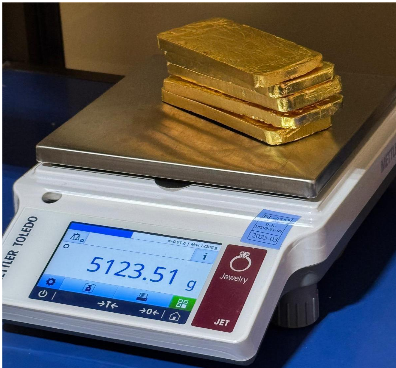
IC Images, live RWGFP transaction in progress 15 th October 2025, Accra, Ghana